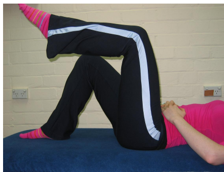
Hip ROM with core control