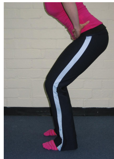
Squats with hip centered & core active