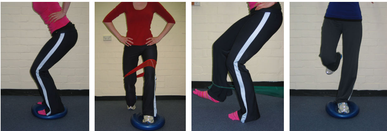
Squats and lunges with air cushion