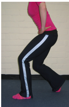
Lunges with hip control Operated hip forward