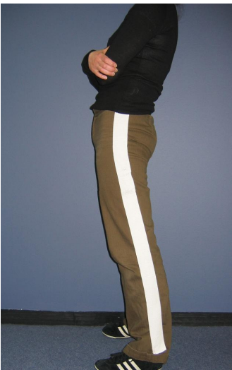
Poor standing alignment with hip anterior of base of support